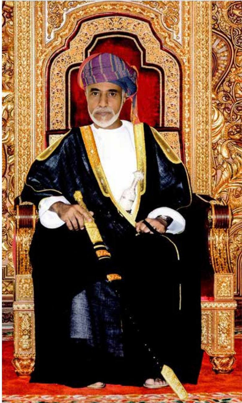
The late Sultan Qaboos bin Said , may his soul rest in peace