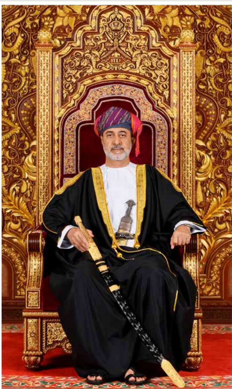
His Majesty Sultan Haitham bin Tariq